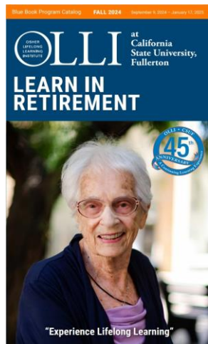
Cover photo: Barbara Talento

Go to http://olli.fullerton.edu and click the link labeled View Current Catalog under More Information to view or download the current catalog.