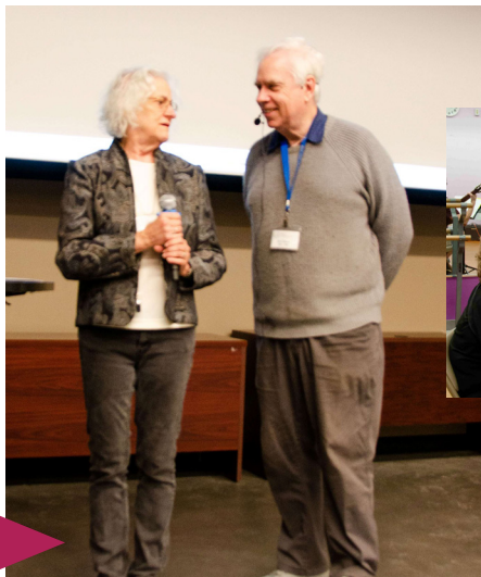
Science For You