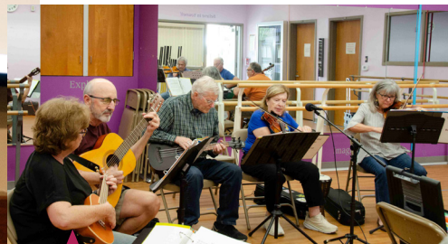
Strings & Things