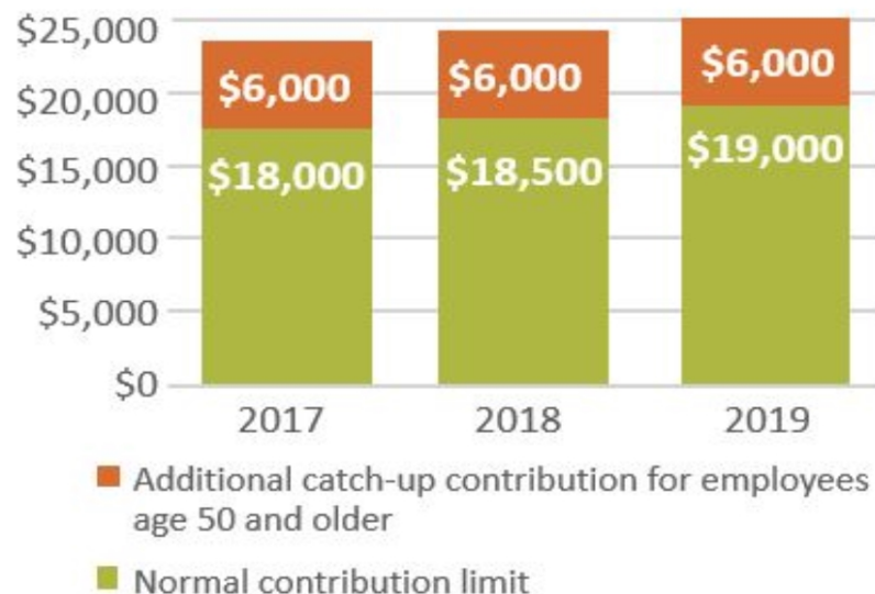
401(k) Plan Employee Contribution Limits

The 401(k) plan has become one of the most popular types of employer-sponsored retirement plans, and for good reason. If you participate in a 401(k) plan at work, you should be taking full advantage by contributing the maximum amount allowed. In 2019, you can contribute up to $19,000 of your compensation to a 401(k) plan. If you're age 50 or older, you can make an additional "catch-up" contribution of $6,000. If your 401(k) plan allows Roth contributions, you can split your contributions between pretax and after-tax Roth contributions in any way you want.