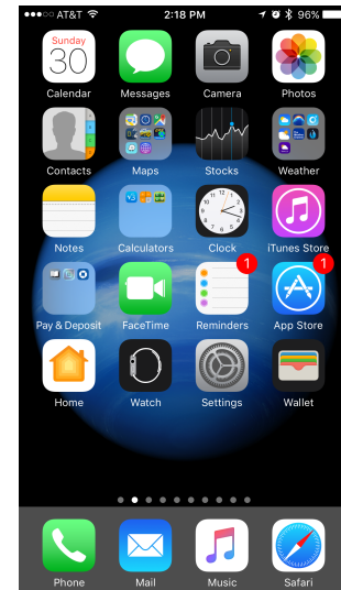
Camera and Photos Apps