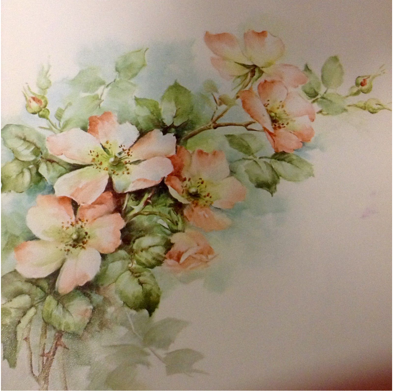
Design and painting by Sonie Ames