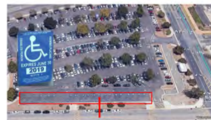
Normally, mostly vacant handicapped placard spaces in Lot G near OLLI Trolley stop

On-duty OLLI Trolley drivers carry a cellphone that is dedicated to responding to calls from OLLI members once they are on campus. You can call 714-853-5436 when you park in a disabled space in Lot G, and the OLLI Trolley driver will answer your call and pick you up.