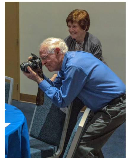
Kirt photographing the Vounteer Appreciation in 2018