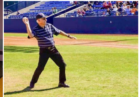
Throwing "second" pitch at Baseball Bash in 2013